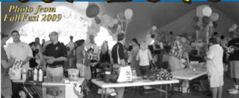
Photo from FallFest 2009

We wait all year for this one, but come Saturday, September 25th it's time again for our annual family picnic and pool trade show in the park, FallFest 2010! Everyone in the pool and spa business is invited to attend for free. You do not have to be a member of IPSSSA or APSP, either.